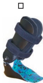
FPA-50 Articulating Dorsi-Assist