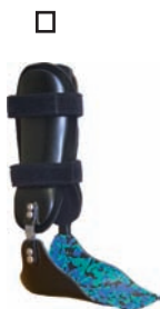
FPA-40 Free Motion w/ Joint