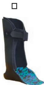
FPA-10 Solid Ankle