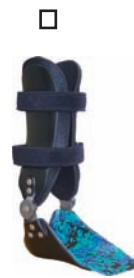
FPA-60 Articulating Range of Motion