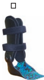
FPA-20 Overlap Free Motion